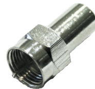
CF 2150 A