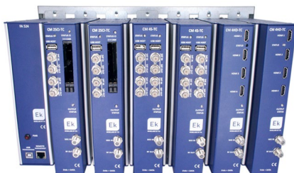
CHM TR MOUNTING