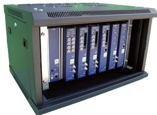
CHR TR MOUNTING