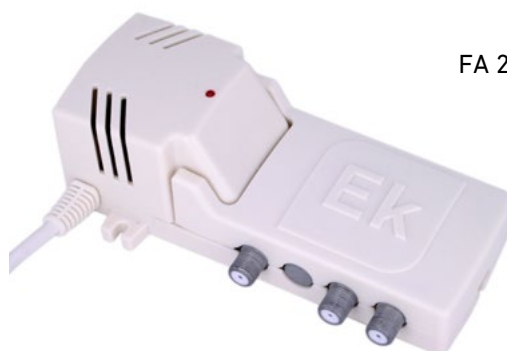
FA 242 / FA 121