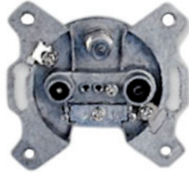
AO 90 S