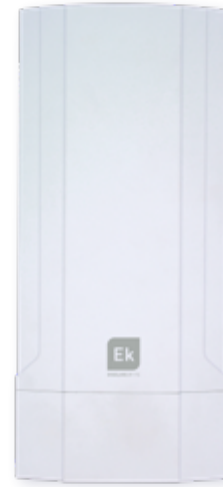
TR 1200 OLP