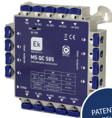
MS QC 585