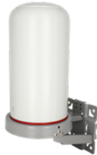
ODU LTE 4G